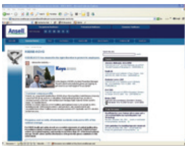
You take total control of your web marketing efforts.